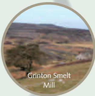
Grinton Smelt Mill