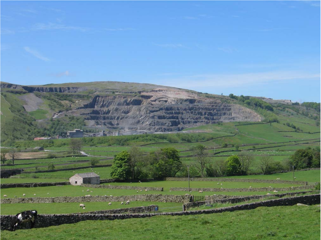
Arcow Quarry, Ribblesdale