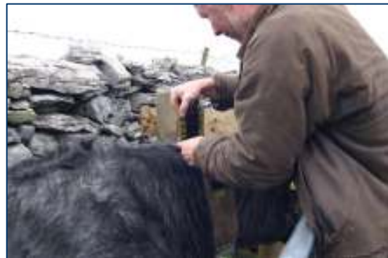
Figure 2. Attaching the GPS collar to a blue-grey heifer