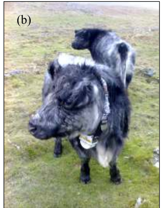
Figure 1 . Blue-grey heifer equipped with (a) BlueSky Telemetry GPS-collar and (b) Lotek Wireless GPS collar